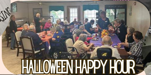
HALLOWEEN HAPPY HOUR