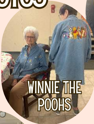
WINNIE THE POOHS