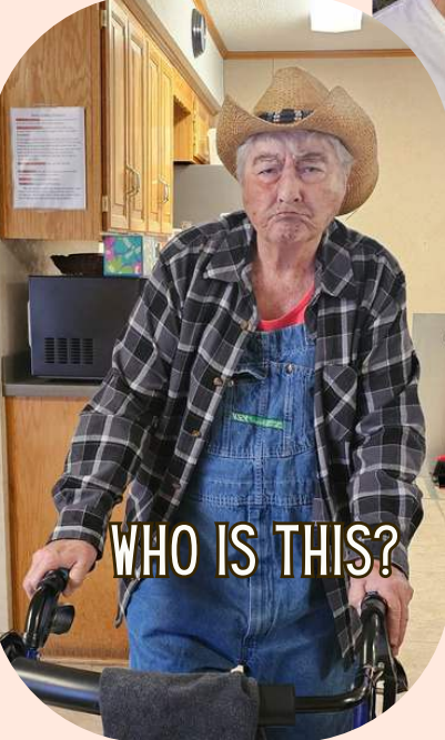
WHO IS THIS?